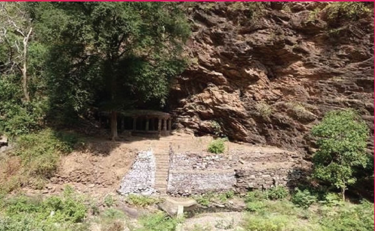
Path to Spectacular Cave temple